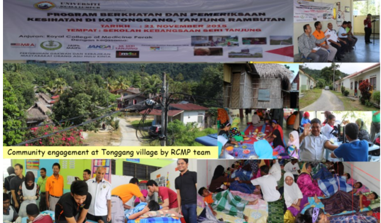
Community engagement at Tonggang village by RCMP team

These engagements rendering medical and social services to various Orang Asli indigenous communities living in remote areas has become a regular program loved by RCMP staff and students and appreciated much by the indigenous people as well. While promoting the health of the indigenous peoples, it enforced the spirit of altruism and volunteerism among our students, and fostered linkages and collaboration within and outside the university.