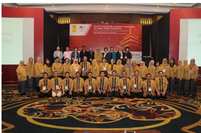
The APACPH executive board members with the organizer of the conference committee

We will continue to develop strong cooperative, respectful partnerships between APACPH members, as well as between us and government sectors, non-government agencies and responsible business entities so as to create a health enhancing environment enabling all to achieve optimal health in an environment that is sustainable and conducive to health.