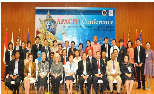
First APACPH Accreditation Conference-Mahidol University, Bangkok, Thailand (2012)