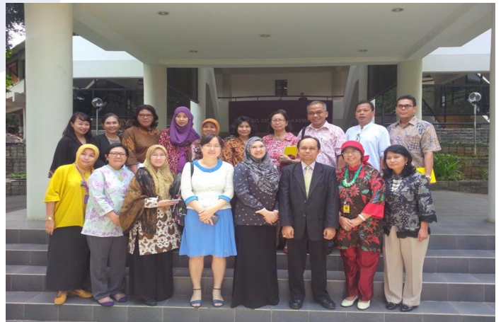
Accreditation Exercise held in Universitas Indonesia, Indonesia (2015)