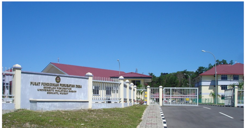
Rural Medical Education Centre Universiti Malaysia Sabah