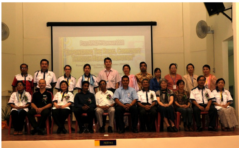
Post-APACPH Seminar 2008 in RMEC UMS