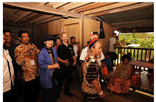
Visit to rural village