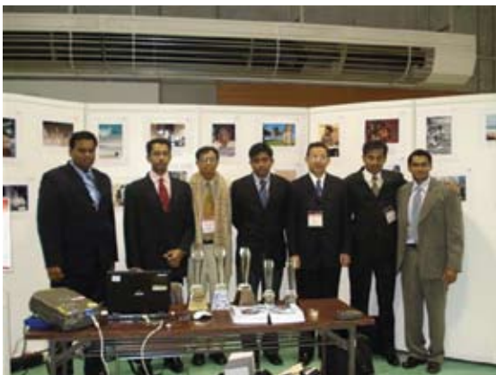
"Reflections" Photo Exhibition at the APACPH Conference, Japan 2007