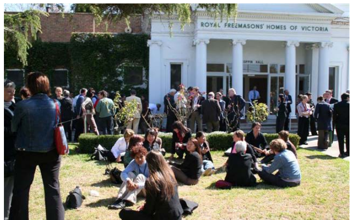
Participants enjoying a catered lunch on the gardens of the forum venue

You can also visit the website to download the presentations - http://www.med.monash.edu.au/epidemiology/iphu/symposium.html