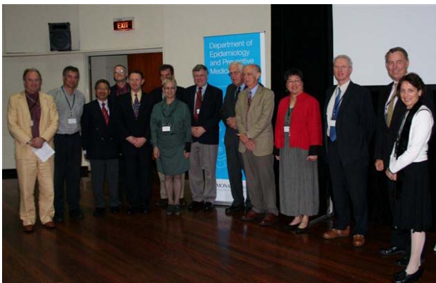
Group photo of keynote presenters and panel speakers at the forum