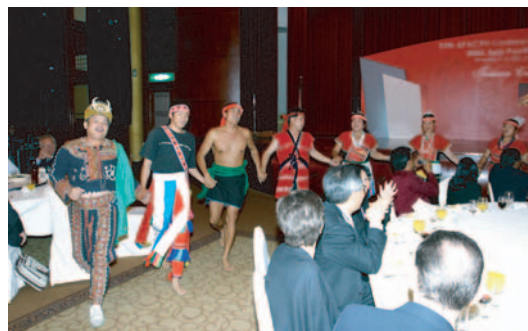
Conference delegates were treated to a cultural experience at the conference social events (left and below)