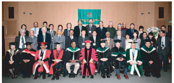
APACPH General Assembly (new member and APACPH Executive in front row)