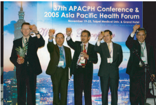
Conference hosts and members of the APACPH Executive welcome delegates to the 37th APACPH Conference