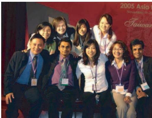
Members of the Early Career Network at the APACPH Conference in Taipei

at the idea of a network, run by them and for them, and its potential to provide support, advice and information on all aspects of public health. There was genuine excitement for the future of the Early Career Network and discussion and ideas continued to flow over the following days of the conference.