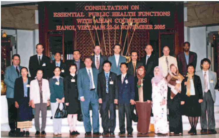
Delegates at the WHO Consultation on Essential Public Health Functions in the Western Pacific Region