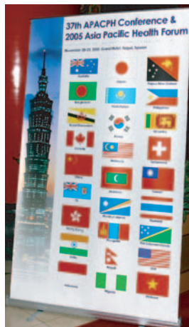
27 countries were represented at the Conference and Forum