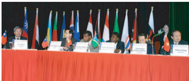
The Asia-Pacific Health Forum included panelists from Australia, Fiji, Japan, Maldives, Marshall Islands, Papua New Guinea, Taiwan, Thailand, the Solomon Islands and Vietnam