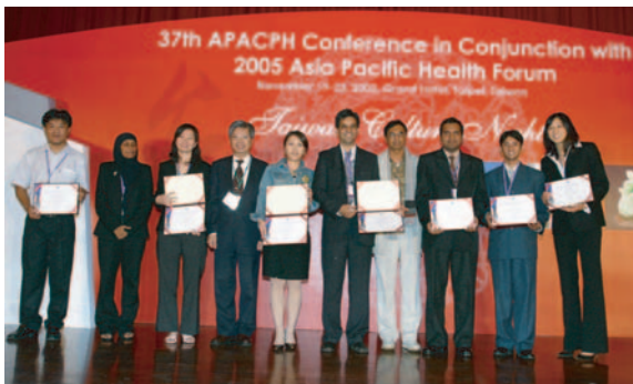
10 student and 10 junior professional travel awards were offered by the Conference organisers