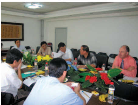
Delegates at the Special China Regional Meeting of APACPH